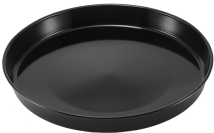
Round Tray (Larger Than Pizza Tray)